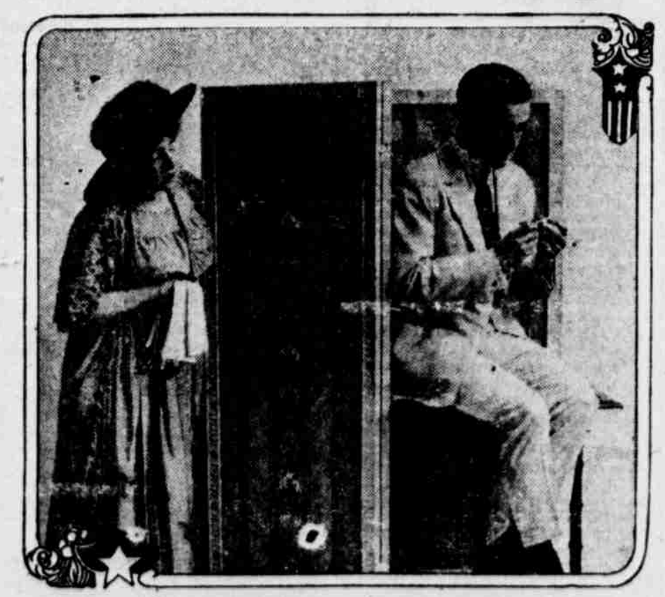
PRESENT A CHAUTAUQUA PROGRAM WHICH IS FULL OF NOVELTY. MUSIC AND GOOD CHEER.