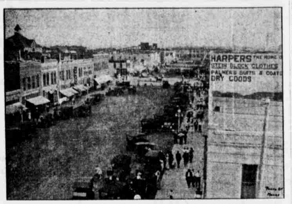
STREET SCLNE ON A BUSY DAY IN ALLIANCE

During the life time of the organization almost $10,000,000 worth of cattle have been recovered for our members at the market points. This work was done at a cost of about $100,000, while $50,000 was expended in range detective work and prenual meeting of your organization cautions. Your interests have been must recall to the minds of some of represented and safeguarded in the those present, the congregating of a state legislatures, before the depart-