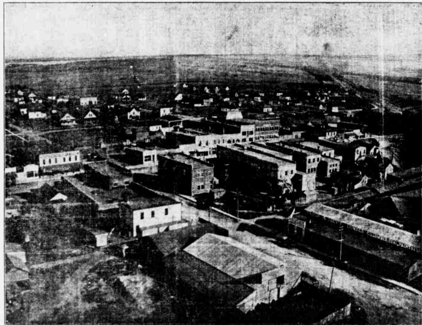
Bird's Eye View of Part of Business Section of Bridgeport