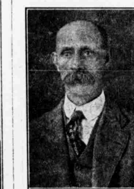
hereby announce that I am a canth Democratic Primaries. April 18 Your support will be appreciated

lifelong experience as a farmer teacher, lawyer, legislator and Judge makes him truly "The People's Candidate."