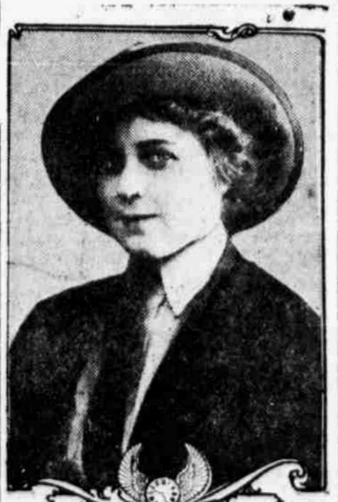
Mignon Anderson, Star of "The Woman in Politics," Mutual Masterpicture, De Luxe Edition, in Five Parts. Produced by Thanhouser.

Potted Shamrock—Green carnations and potted shamrock for St. Patrick's Day. Alliance Greenhouse.