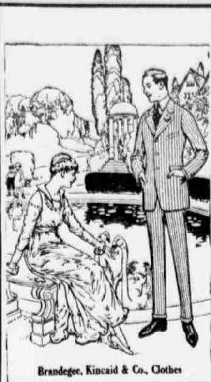
Brandegee, Kincaid & Co., Clothes