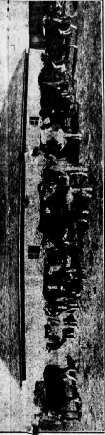
A Herd of Good Money Producers near Hemingford, Nebraska

REFERENCES: The Alliance Commercial Club, Alliance, Nebraska; The First National Bank, The Alliance National Bank and the First State Bank of Alliance, Nebraska; The First National Bank and the First State Bank of Hemingford, Nebraska.