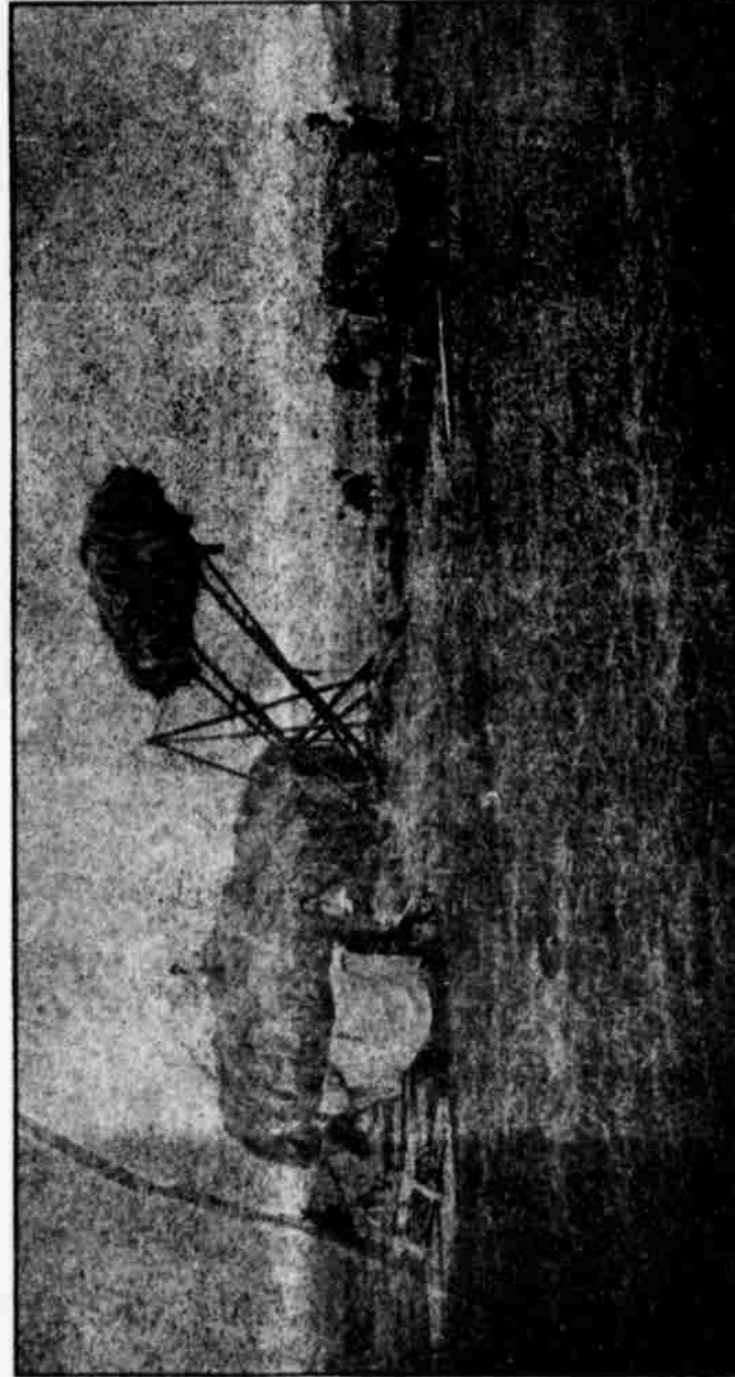
Alfalfa Hay Scene in Box Butte County, near Alliance

SOIL , a black loam soil with a clay subsoil—just the kind of