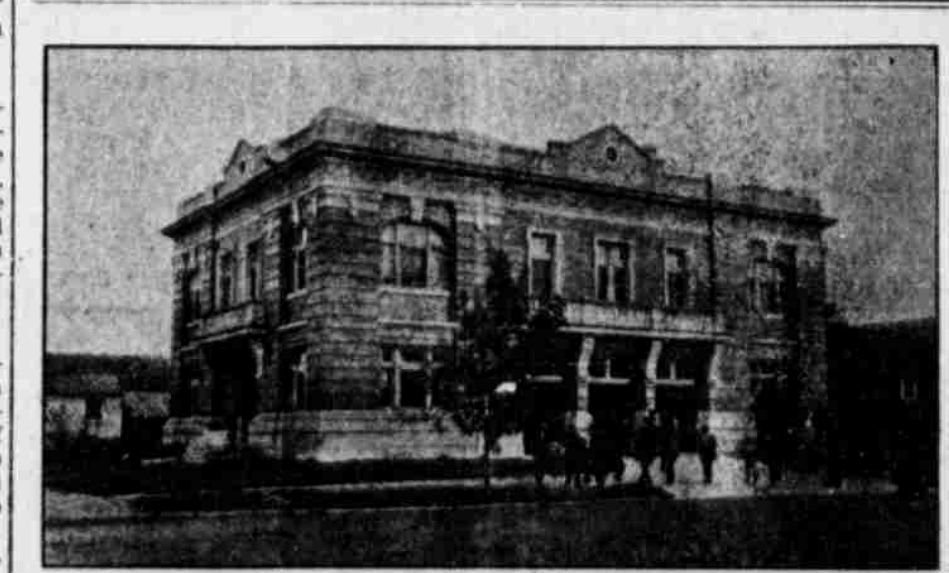
SEWARD DEPARTMENT AND CITY HALL

The above is a picture of the home of the Seward Fire Department. The