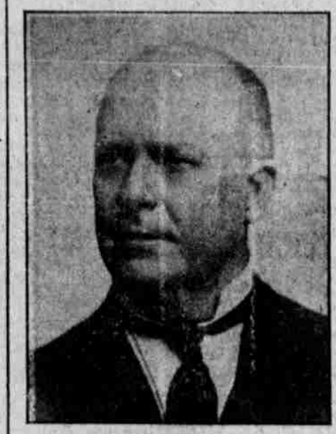
W. S. RIDGELL State Fire Commissioner Candidate for State Railway Commiss one Democratic Ticket Primaries, April 18, 1916 Your support will be appreciated

day, April 18, 1916. I will appreciate your vote. GEORGE FLEMING.