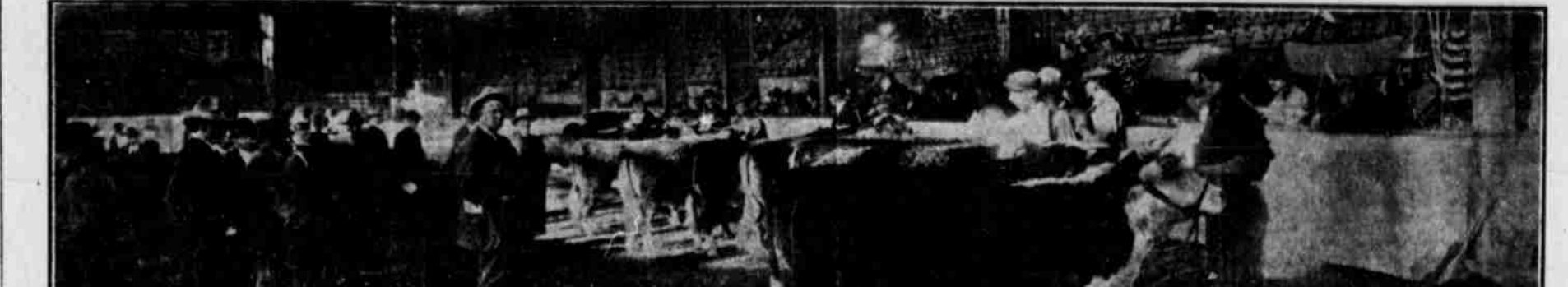
Judging Cattle in the Arena at the National Stock Show