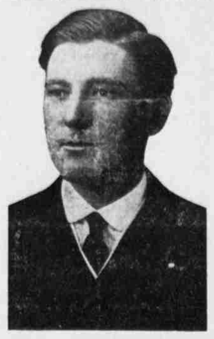
Politicians and Newspapers

Legislators of Alabama have been tepping on the toes of the newspapers of that state, and now the newspublishers are making a mighty howl for protection of their business against the marauders. This is the first time the newspaper publisher of Alabama has felt the devastating hand of business legislation. and it has been found to hurt. The Alabama newspaper publisher, like those of many other states, has been going along in the more or less even phate costs but very little at the drug tenor of his way, getting out the pastore but is sufficient to make anyone per, hustling around for money to an enthusiast on inside-bathing. Men pay for white paper and being genand women who are accustomed to erally Johnny-on-the-spot in boostwake up with a dull, aching head or ing his home town and plugging for progress and patriotism. He can't maintain a paid lobby at the capitol to protect his business, and he hasn't thought much of that anyhow. When a professional politician gets into the