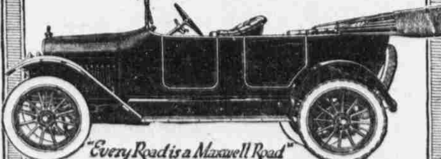
"Every Road is a Maxwell Road"

One Man Mohair Top $655 Electric Starter Demountable Rims $655 Electric Lights Rain Vision Windshield Magneto Ignition F.O.B. DETROIT