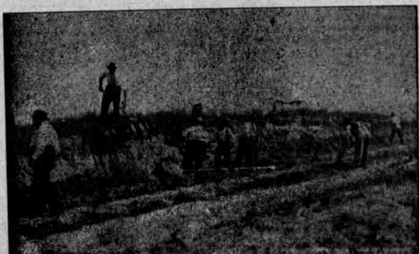
CAUGHT IN THE ACT

WHEN THE ALLIANCE BUSINESS MEN MADE GOOD ROADS