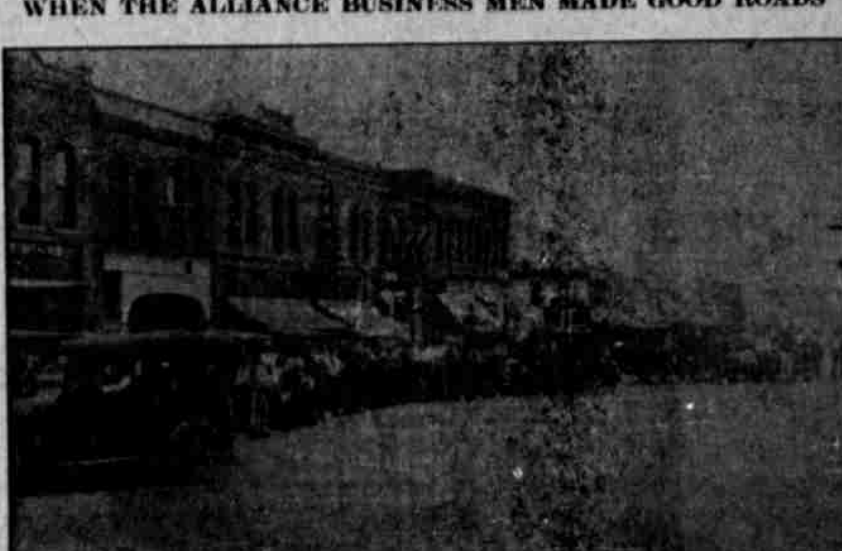
READY TO START

WHEN THE ALLIANCE BUSINESS MEN MADE GOOD ROADS