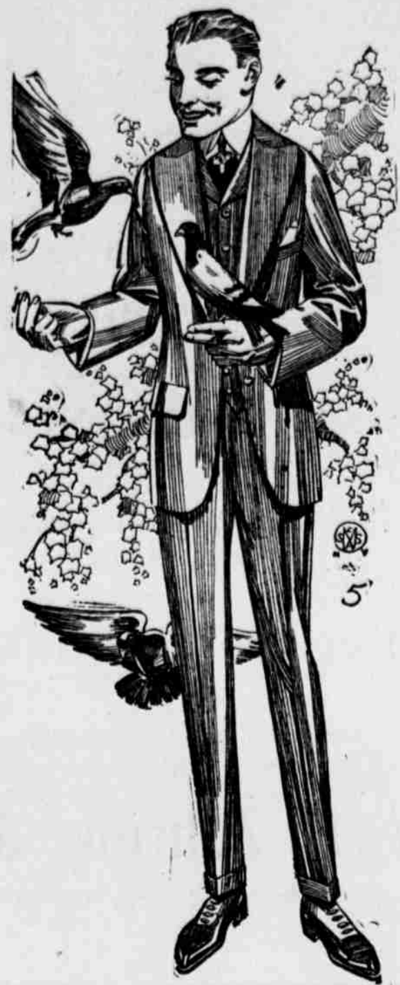
Modern Clothes for Men