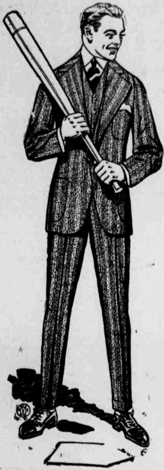
Modern Clothes for Men