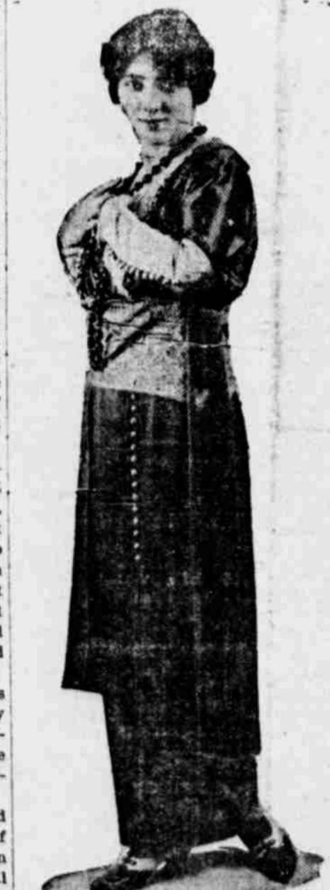
STYLISH AFTERNOON GOWN.

If your subscription to The Herald is due, better pay up now and take your choice of the 35 magazine clubs.