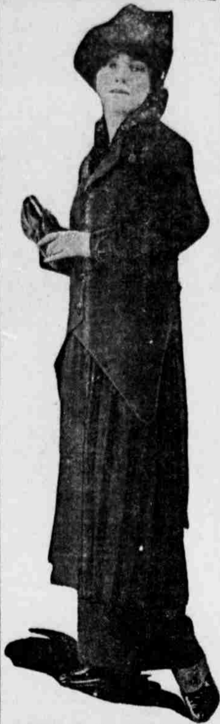
AMERICAN TAILORED SUIT.

THE VALUE of well-printed neat-appearing stationery as a means of getting and holding desirable business has been amply demonstrated. Consult us before going elsewhere