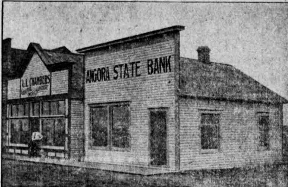
Angora State Bank and Chambers' Store