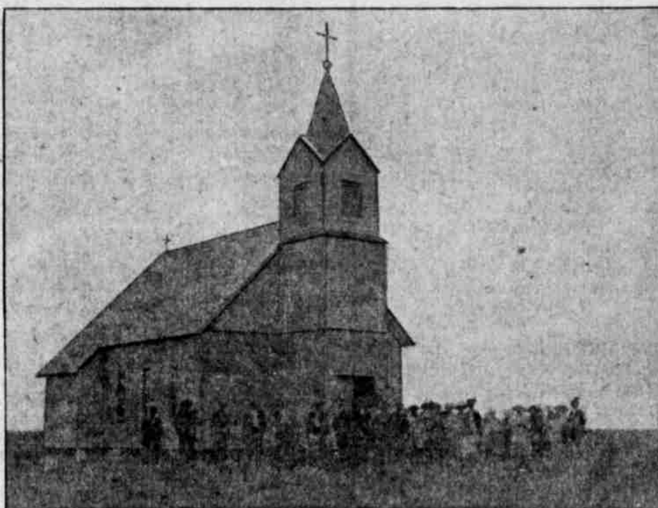
Catholic Church of Angora