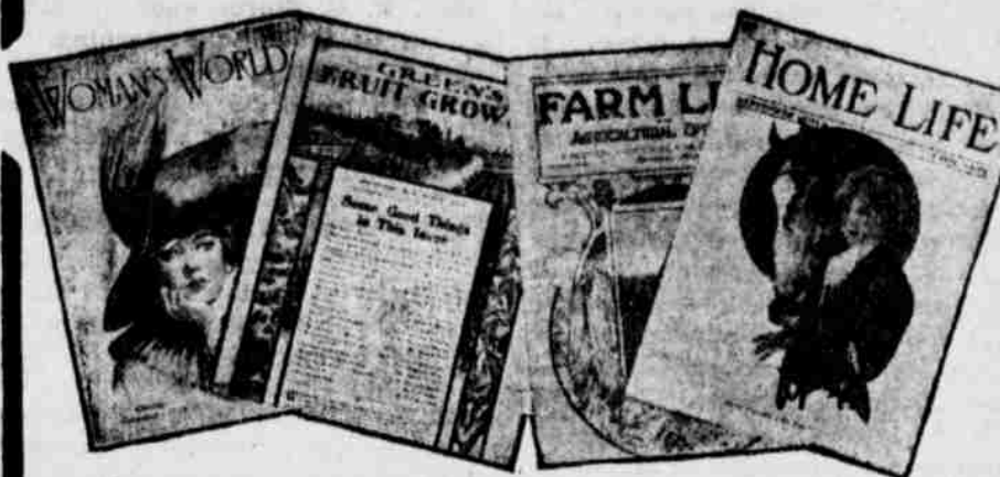
Woman's World, 35c yr. Green's Fruit Grower, 50c yr. Farm Life, 25c yr. Home Life, 25c yr.

$1.68 This Is Our Best Offer $1.68 These Four First-Class Magazines and Our Paper, ALL FIVE ONE YEAR, Only