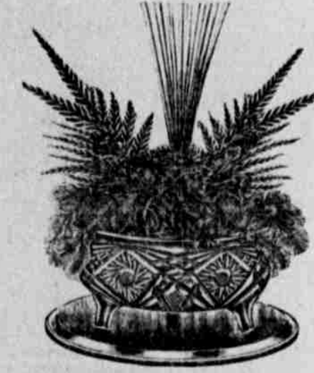
Eight-inch Fern Dish, Cut Glass, $1.50. Plant for 50c

We can show you the latest electric utensils. Grills, percolaters, toasters and chafing dishes in quality