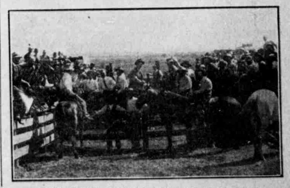
SOME OF THE BUYERS AT THE BIG HORSE SALE

There will be a business meeting of the Girls' Four Square Club, at The low price for school children is arc requested to be present