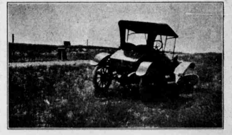
Scene of the auto accident early Sunday morning. See explanation in article.