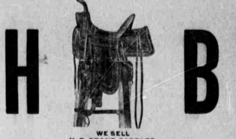
WE SELL H. B. BRAND SADDLES

Made especially for the western trade. Call and see our full line of saddles, harness, collars, nets and covers