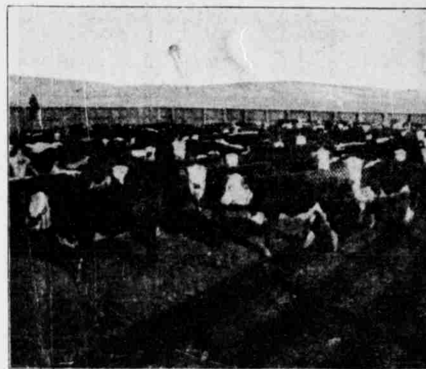
A Few Thoroughbreds

Write for any other information you desire or come to see these ranches. They are selling fast. Now is the time to get a good ranch at a bargain price.