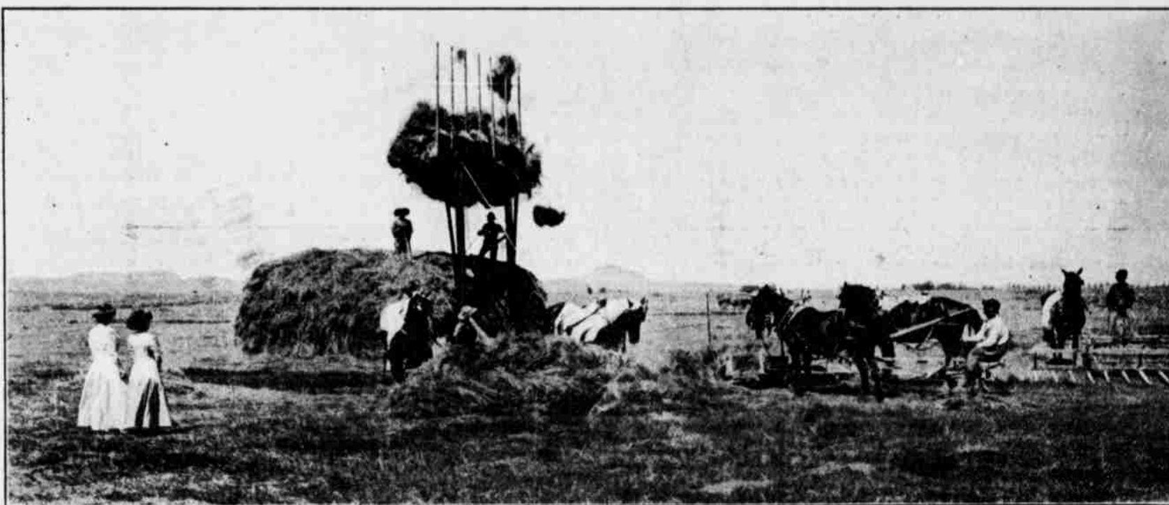
Haying Time on a Ranch

2,500 acres patented, and a school section. Two and one-half miles from post office. School on land. Ample hay. Snake river, never dry, runs mile and half through land. Two frame houses, blacksmith shop, stable, cattle sheds, windmills, tanks, etc.