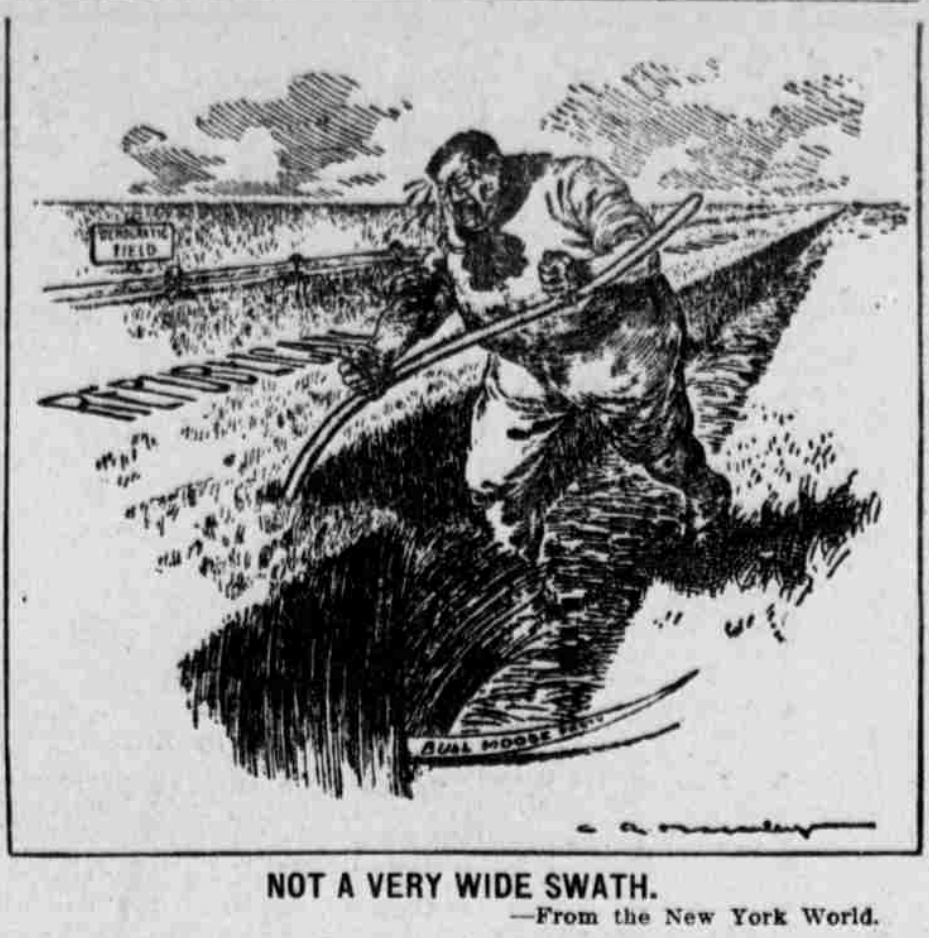
NOT A VERY WIDE SWATH.