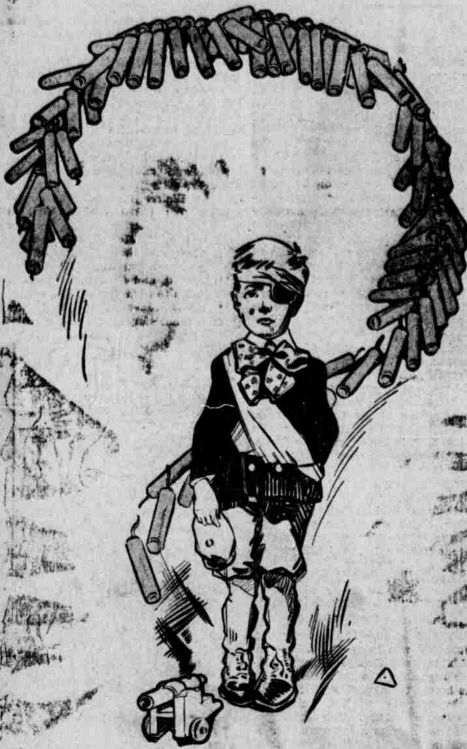
—Skidmore in Human Life