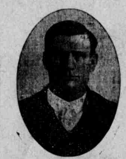
SHERIFF OF BOX BUTTE COUNTY

Candidate for Renomination ON THE DEMOCRATIC TICKET