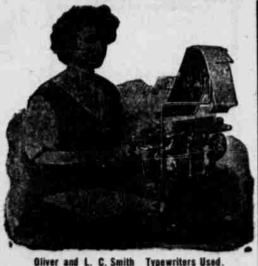
Oliver and L. C. Smith Typewriters Used.

Commercial Department OF ST. AGNES ACADEMY ALLIANCE, NEBR. Call or Write for Information