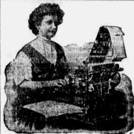
Oliver and L. C. Smith Typewriters Used.

ALLIANCE, NEBR. Call or Write for Information