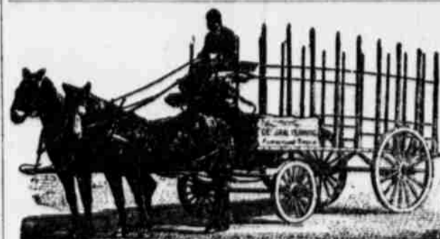
OFFICE AT RODGERS' GROCERY PHONE 1

Building Material, Piles, Posts HEMINGFORD, and Coal NEBRASKA