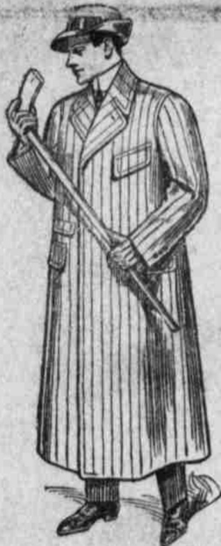
Brandegge, Kincaid & Co. Clothes.

T HERE'S not a flippant feature in Brandegge Kincaid & Co. Clothes. There's not a stitch but what can be depended upon. There is not a line that does not add "class." Tailored with a precision that cannot be excelled and styled according to fashion's latest dictates.