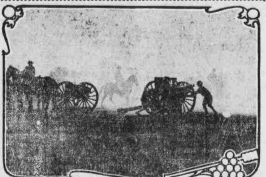
Artillery in action. First round has just been fired and weapon is being prepared for the second round. Six shots in 1 minute and 12 seconds is the record of the First Artillery which will participate in the Omaha Tournament.