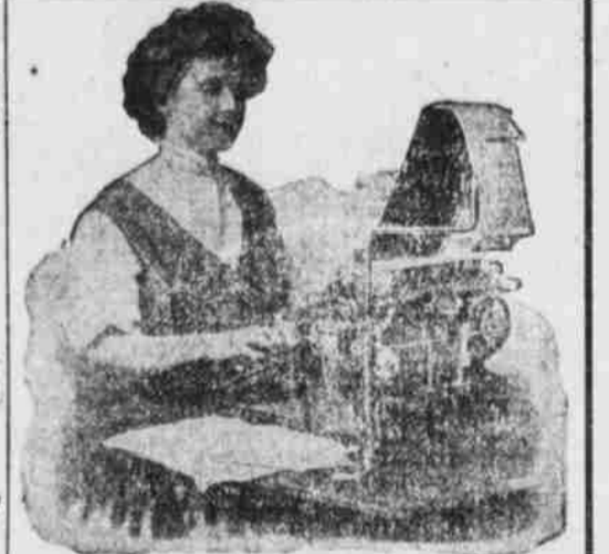
Oliver and L. C. Smith Typewriters Used.