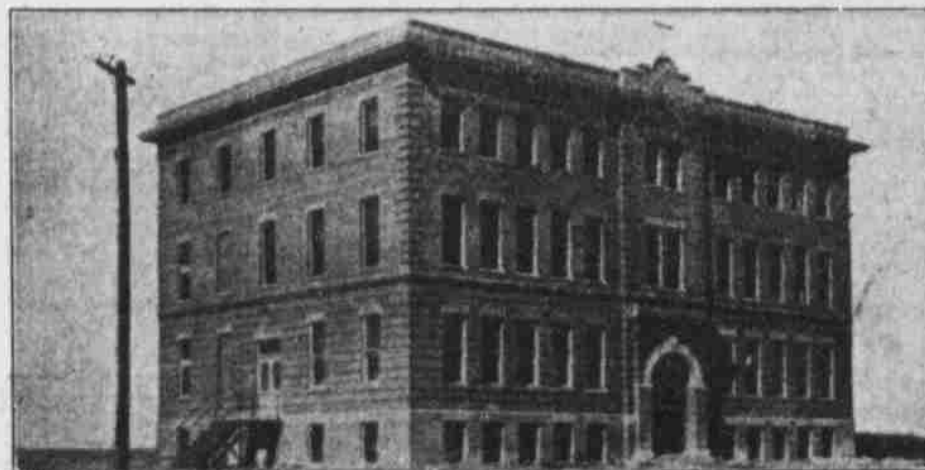
ST. AGNES ACADEMY