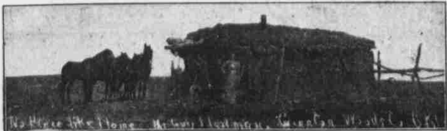
PIONEER DAY SCENE

TRY A CLASSIFIED WANT AD. In THE HERALD, They Bring Results