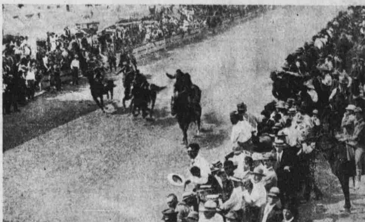
A COW BOY RACE AT ALLIANCE

The Alliance Grocery sells six carloads per year of Crete Flour Mills production. Their special flour sale this week is a big one. Notice their ad elsewhere in this paper.