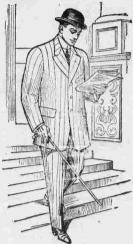
Brandee, Kincaid & Co. Clothes.