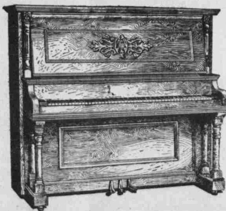
Bennett Pianos are Honest Pianos!