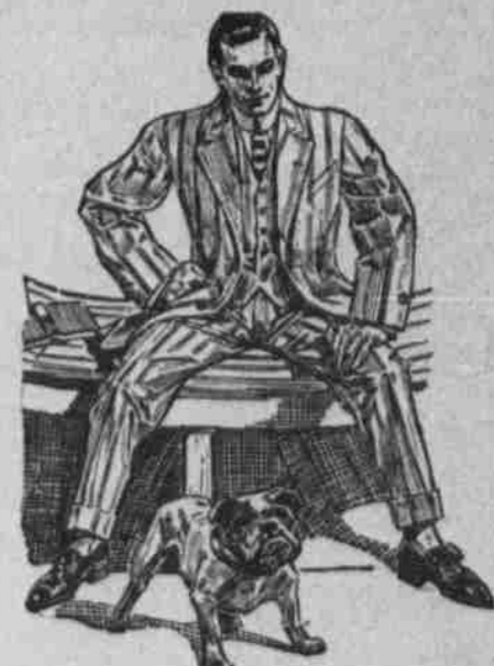
College Chap CLOTHES