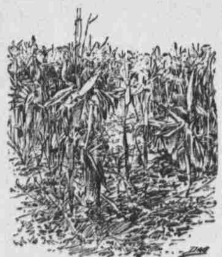
FIG. V-SEED RABS ARE PLENTIFUL.

Selecting and Testing. Along in February the corn should be sorted, picking out only those ears of fair size, well filled at the butts and tips and symmetrically shaped throughout. Further instructions for selecting corn will be given in article 6. After the corn is sorted a few ears should be taken from a number of ears in different parts of the seed room and tested. A fold of moist flannel between two dinner plates makes a good tester. Put the corn between the layers of cloth and set it in some out of the way place in the living room. In three or four days it will be ready to exam-