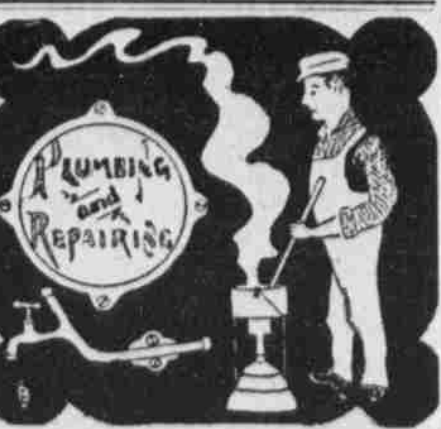
When a Plumber is Needed

send for us. We have plenty of time now to attend to all classes of work This is not our busy season and it will pay you to have your