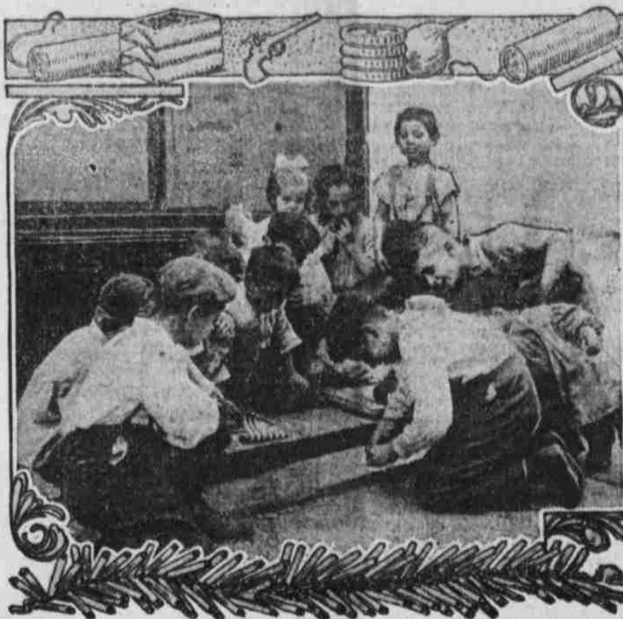
A GROUP OF PATRIOTS HARD AT IT.