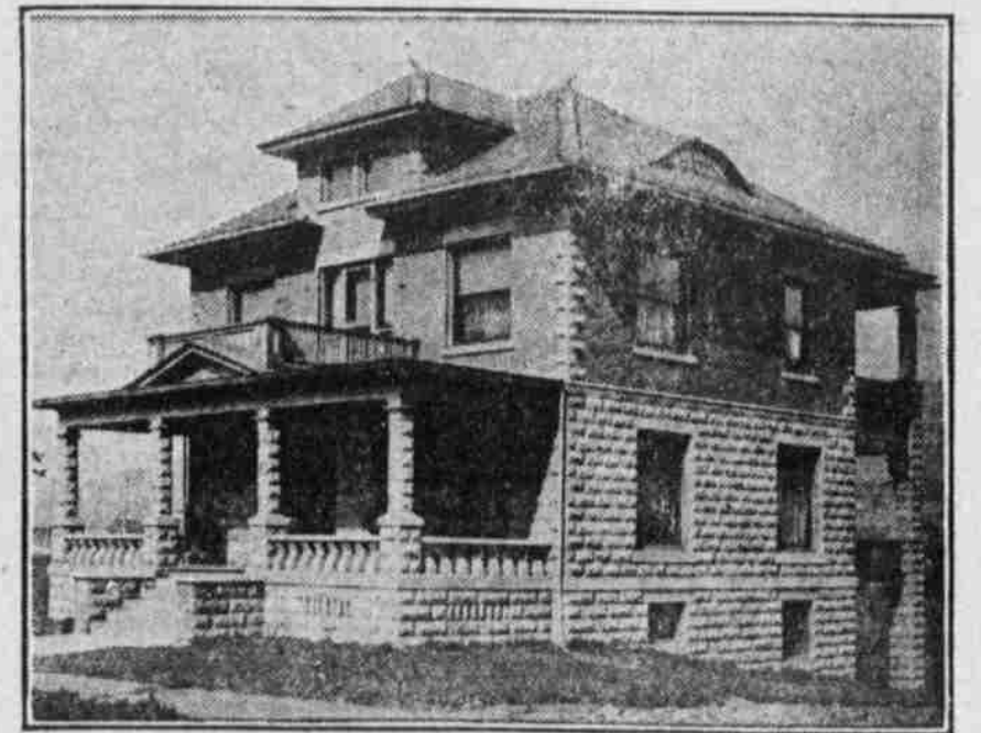
PERSPECTIVE VIEW—FROM A PHOTOGRAPH.

Copyright, 1900, by the Thompson Architectural Company, Olean, N. Y.