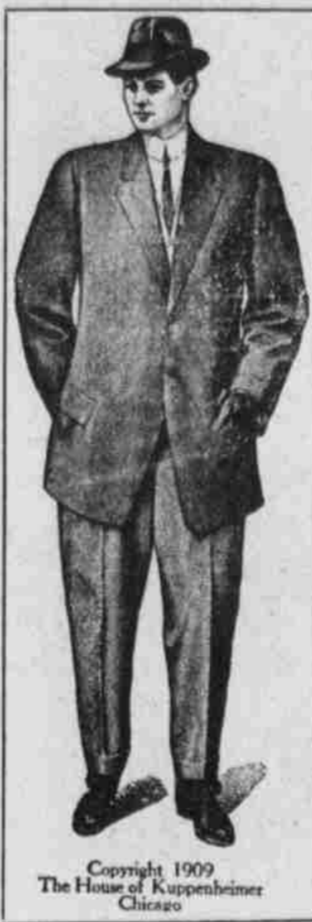
Copyright 1909 The House of Kuppenheimer Chicago

In order to make these six days' sales a record-breaking week in our Clothing Department, we have decided to give with each suit sale, one pair of Dress Shoes absolutely free.