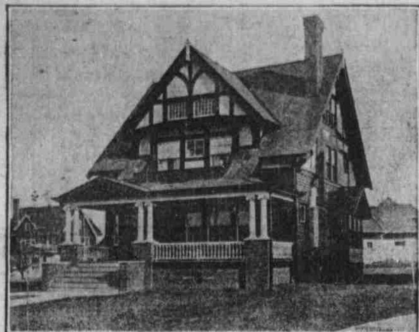
PERSPECTIVE VIEW—FROM A PHOTOGRAPH