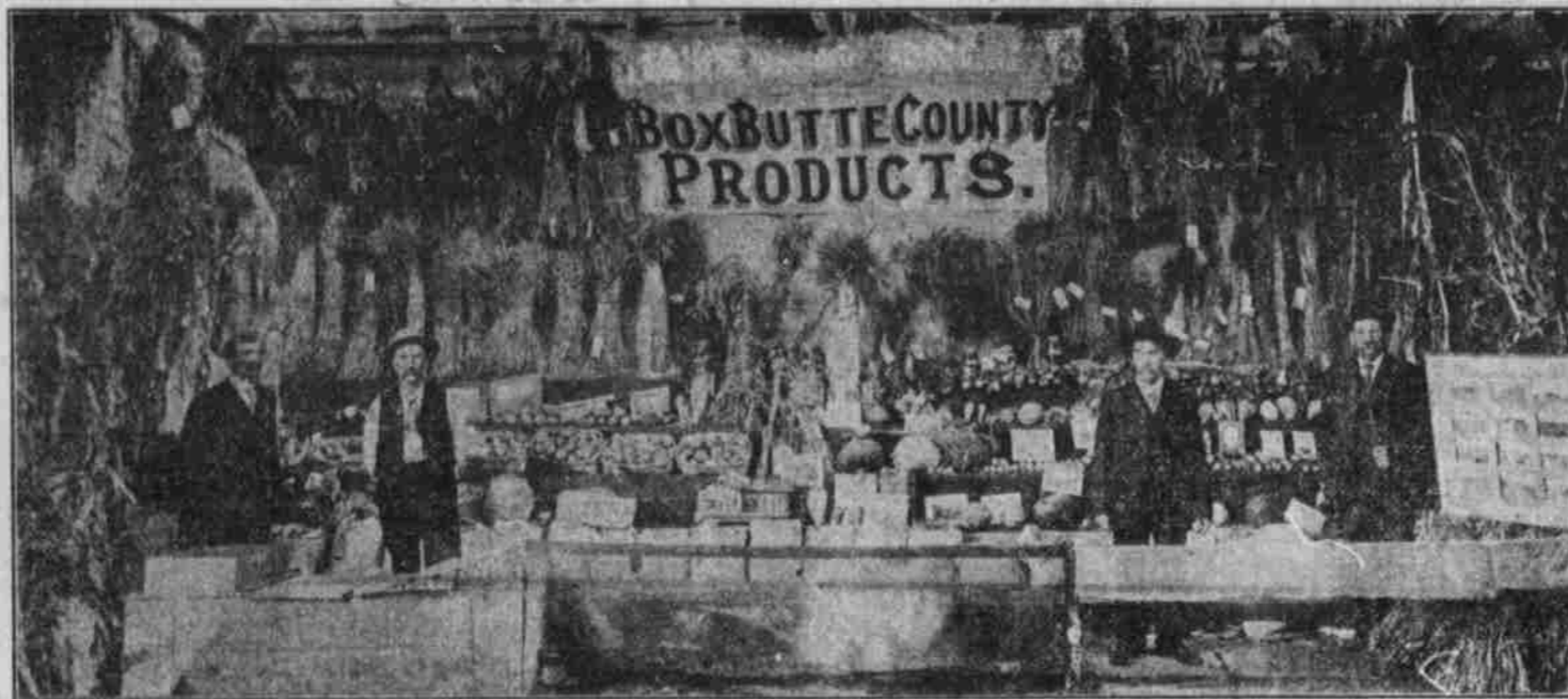
BOX BUTTE COUNTY PRODUCTS

is found at a depth of from forty to seventy feet. Good sheet water without alkali.