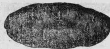
THE POTATO Our Leading Crop

I am not exaggerating when I say that our crops are getting to be as good as those raised on higher-priced land farther east. Potatoes, corn, and all kinds of small grain are raised in abundant crops. It is not unusual for the crops to pay for the land in one year. Where else can you do this. We have good transportation facilities and get the best prices all the time.