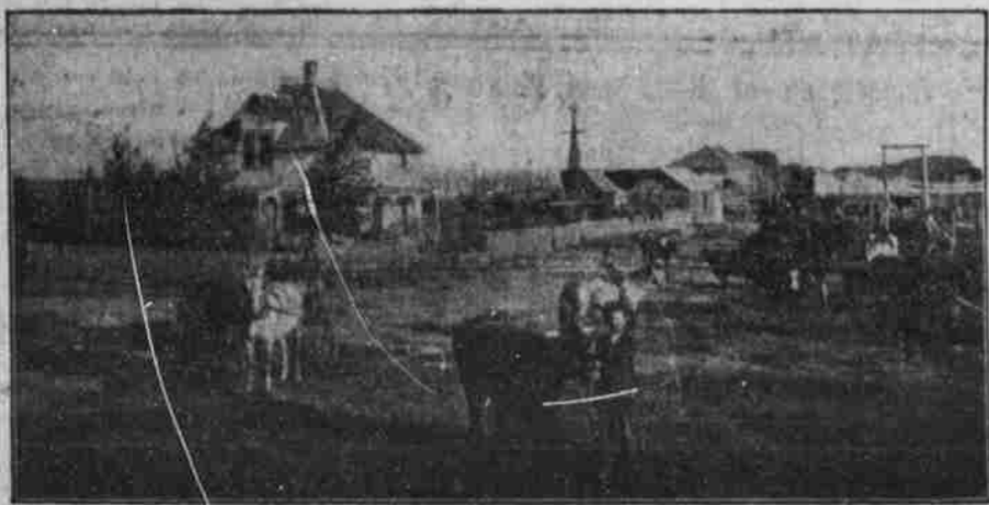
Box Butte County Farm Scene

I HAVE THOUSANDS OF ACRES OF THE FINEST FARMING LAND IN THE WEST FOR SALE AT THE LOWEST PRICES. LAND WILL MAKE YOU FROM 50 TO 150 PER CENT ON YOUR INVESTMENT. WRITE ME AT ONCE, TELLING ME WHAT YOU WANT AND WHEN YOU CAN COME TO SEE IT. I WILL BE GLAD TO SHOW IT TO YOU AND WANT THE OPPORTUNITY TO PROVE THE STATEMENTS MADE ON THIS SHEET