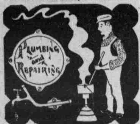
When a Plumber is Needed

send for us. We have plenty of time now to attend to all classes of work This is not our busy season and it will of Venezuela, is also being kept out of ored, a restaurant keeper, which repay you to have your