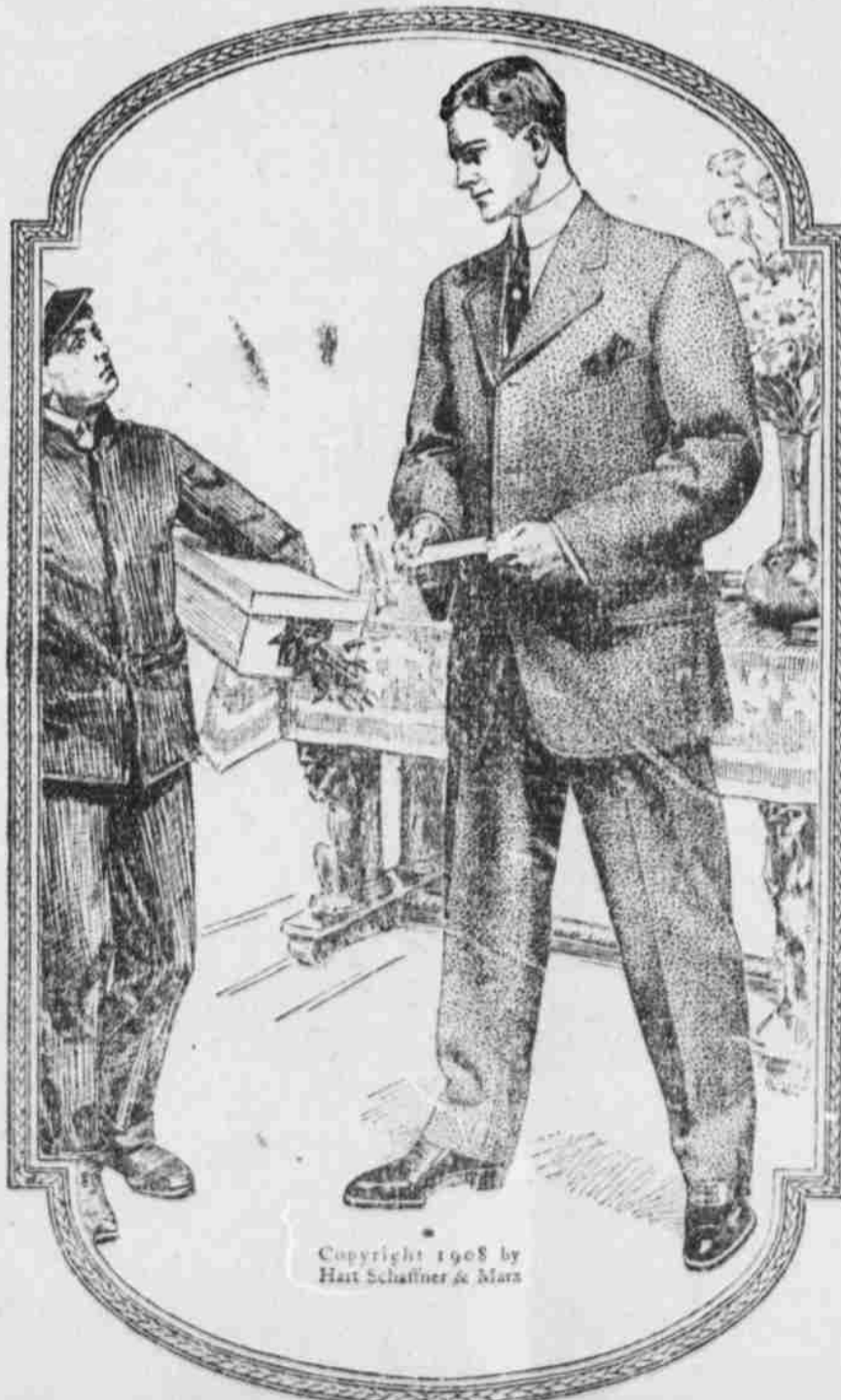
Copyright 1908 by Hart Schaffner & Marx

YOU notice how dressy, stylish, distinguished in clothes, some some men always look. Do you know how they do it? We'll tell you. They buy here