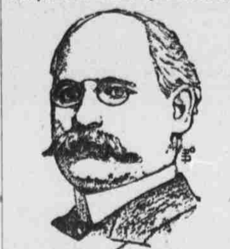
VICTOR H. METCALF.

San Francisco, May 9.—The combined Atlantic and Pacific fleets of battleships, armored cruisers, torpedo boat destroyers and auxiliaries, the greatest assemblage of armored vessels thus far to mark the progress of the American navy to second rank among the floating fighting force of the world, were reviewed in picturesque San Francisco harbor by Secretary of the Navy Metcalf. The forty-four vessels of the two fleets lay at anchor in four long columns and proceeding from the Oakland shore, the secretary, on board the little boat Yorktown, a reminder of the days when the navy was in its infancy, proceeded southward through the two lines formed by the armored cruisers of the Pacific fleet, near the shore, and the second squadron of the