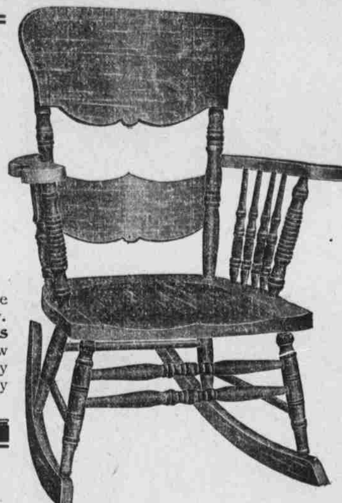
(Exactly Like Cut.)

We Preach Quality We Practice Quality We Give Quality