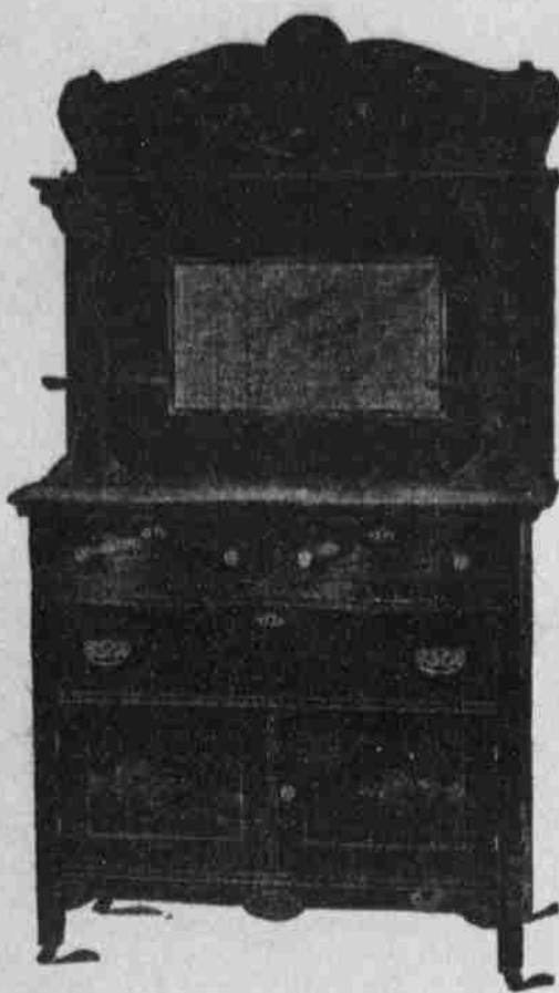
(Exactly Like Cut.)