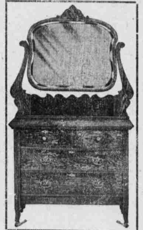
(Exactly Like Cut.)