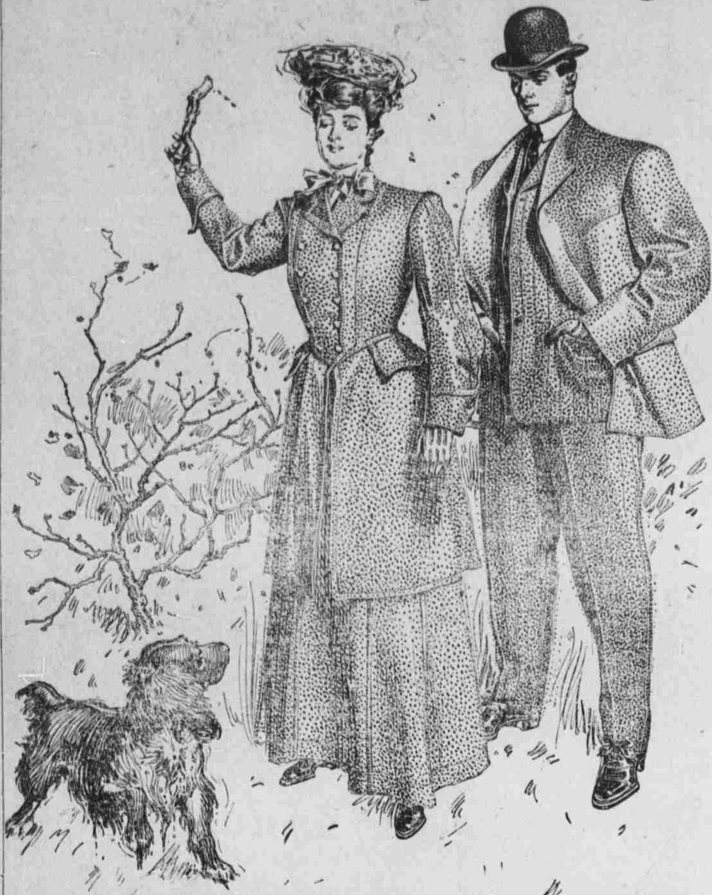
Copyright 1905 by Hart Schaffner & Marx

Y OUR good clothes for Spring are here waiting for you to put on. If you are a man of judgment in clothes, you'll have a chance to exercise it this season, in comparing our suits and overcoats, as made by America's best manufacturers including Sterling, Adler and