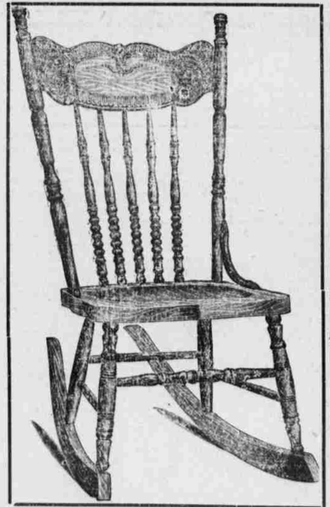
(Exactly Like Cut.)

The same applies to this elm, golden-finished wood seat, braced-back rocking chair.