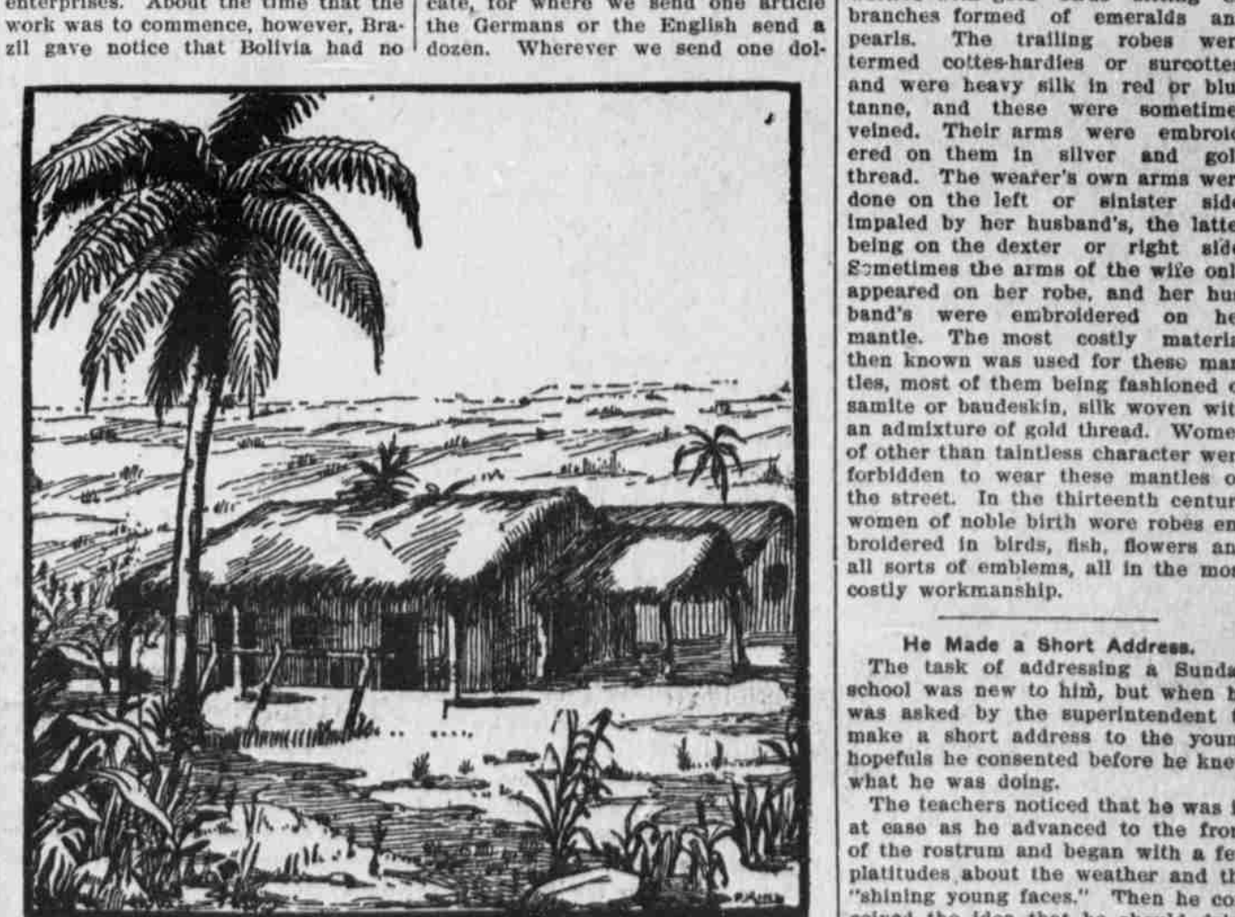
FUTURE COFFEE FIELDS OF BRAZILIAN UPLANDS.

Not less needed will be the great systems of transportation that are now and have been from time to time projected for South America by various combinations of American and English capitalists. Industrial schemes, too, involving the bringing about of vast changes, have quite recently been launched, some of them apparently, it is true—as in the case of the exploitation of the Acre district, in which J. P. Morgan of New York and Sir Martin Conway of London, among others, were interested—only to be abandoned. The Morgan-Conway syndicate had a concession from Bolivia covering a tract of country on the head waters of the Amazon several hundred miles square, in which it was proposed to establish colonies and operate various plantations, timbering and rubber-gathering enterprises. About the time that the work was to commence, however, Brazil gave notice that Bolivia had no