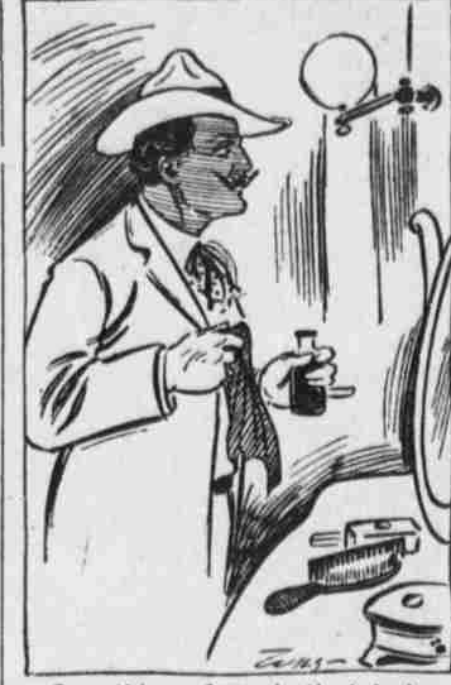
Something of a piratical look.

The New York party will find, if they choose, an ample field for exploration. If by their observation, even in going no further than Iquitos, they are able to bring back to the United States any practical suggestion for the furtherance of our commercial interests, or if their trip is followed by other trips to those regions by competent business men and