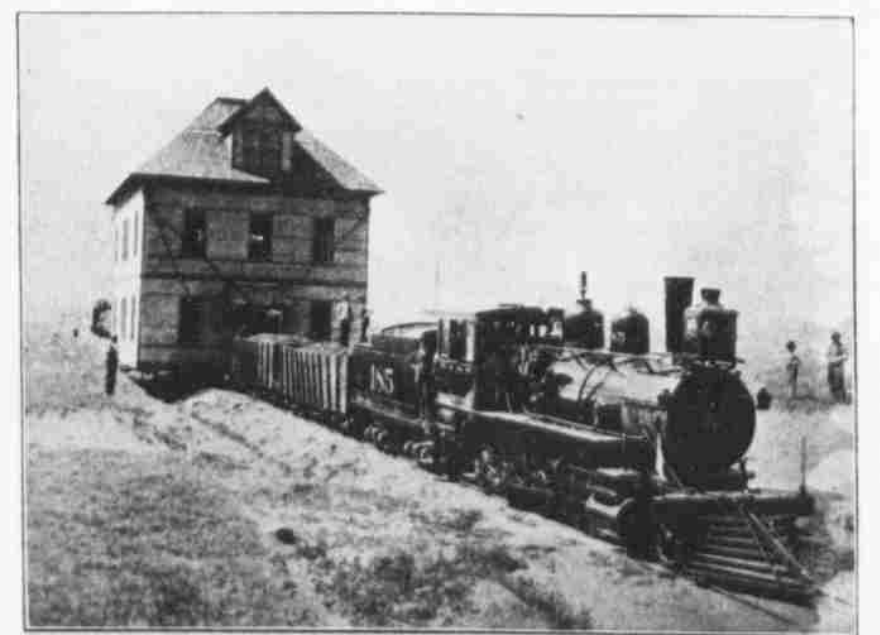
"Transplanting" the Box Butte County Court House.