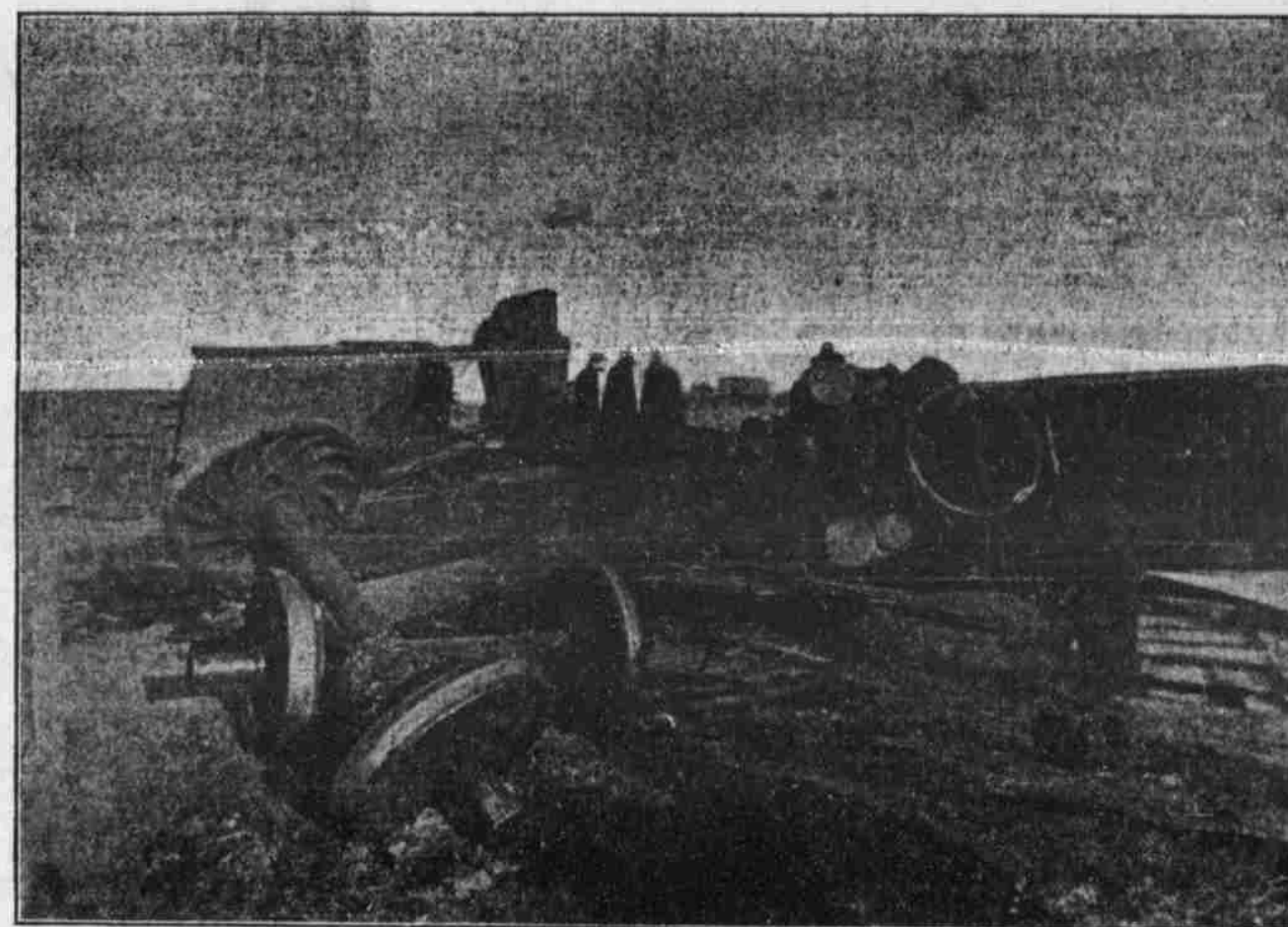
SOUTH VIEW OF WRECK—What remains of the ill-fated engine of freight No. 46.