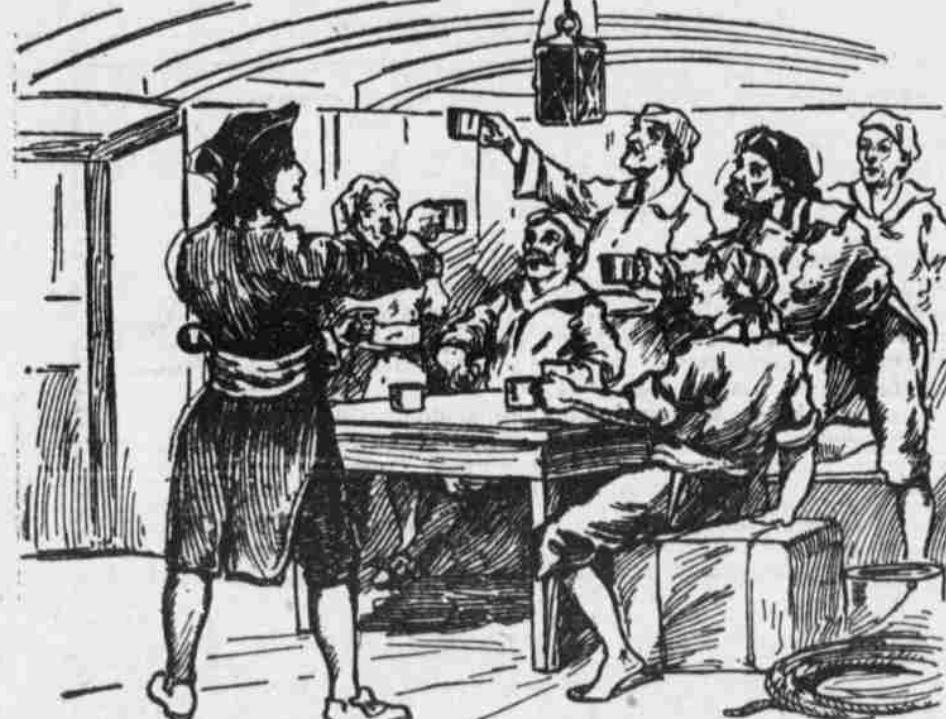
He drank their health.