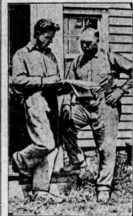
The County Agent Explains the Simplicity of Making a Farm Inventory.

All property owned comes under the head of resources or assets. These may be subdivided into physical or tangible property, and financial, or intangible. The value of the physical property