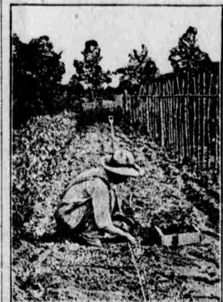
Setting Out Plants Started in Hotbed.

In planning the garden it should be borne in mind that certain crops, such as lettuce, radishes, and early beets, can frequently be grown in the same rows with other crops and be removed before the main crop attains sufficient size to require the entire space. It should also be remembered that carrots, beets, salsify, early turnips, parsnips and all crops of that type may be grown in rows of 12 to 18 inches apart and will occupy a comparatively