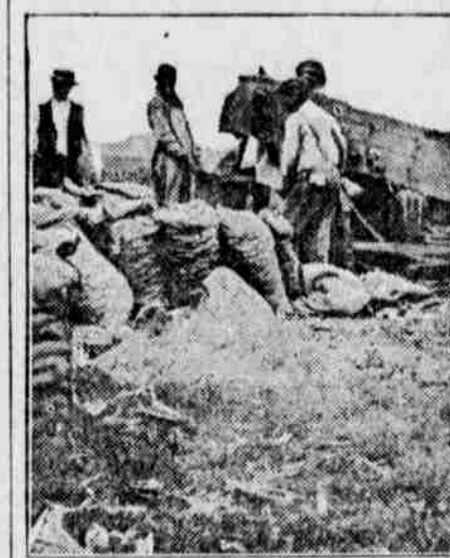
Grading Potatoes in Southern Field

Owing to varying climatic conditions, due to both latitude and altitude, there are three distinct potatocrop seasons in the Southern states. These are the early or truck crop, the late or main crop, and the fall crop,