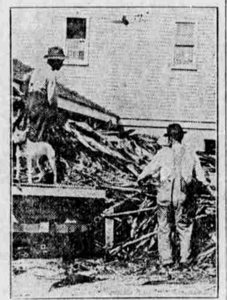
A Low-Down Flat Wagon Saves Labor in Handling Corn When Filling Silo.

If the silage cutter and lifting machinery have not been selected, every effort should be made to get machinery which has sufficient or excess capacity.