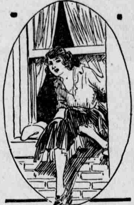
She Escaped Through a Window.